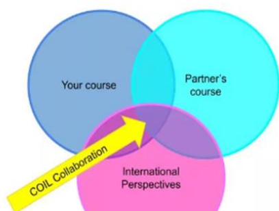
Figure 1 COIL Framework

Applications for the Ulysseus Seed Fund are now open to all disciplines! We invite you to submit your proposals for Collaborative Online International Learning (COIL) designed for Ulysseus students.