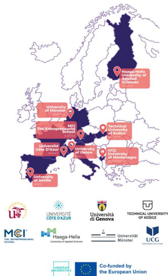
Figure 3 Map Ulysseus European University